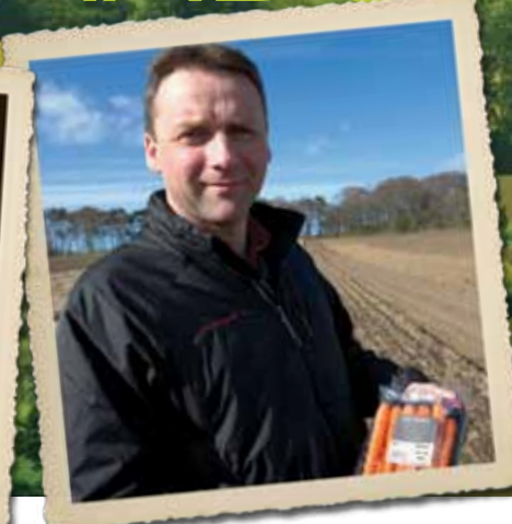
Region: Scotland (Produce)

Capestone also place great emphasis on community engagement and education, hosting visits for local primary school to educate pupils on the important link between food and farming.